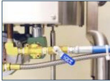
Easy Water Hook-up Cold Water IN / Hot Water OUT